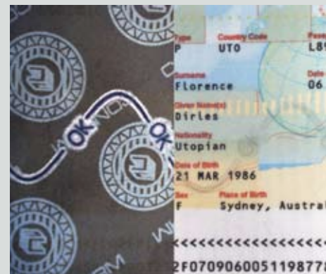
■ Verification of retroreflective security elements