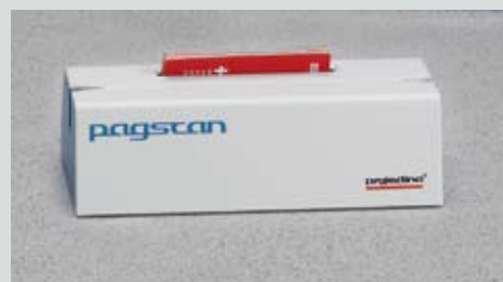
■ PAGSCAN 1000

Computer System QuadCore 2.66GHz, min. 2.0 GB RAM, FireWire (IEEE 1394a), operating system Windows XP Pro or Notebook with operating system Windows XP Pro and FireWire (IEEE 1394a)