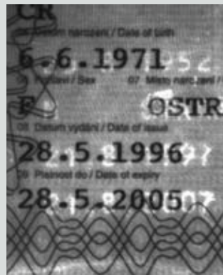
■ Visualization of content forgeries under IR luminescence