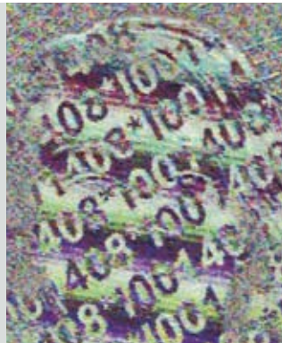
■ IPI Invisible Personal Information

Up to 100 control settings per session and in addition an unlimited number of individual settings can be stored and recalled. This helps to standardise processes, to simplify the workflow and to shorten the investigation time. The PIA-6 software offers the possibility to connect other digital cameras, e.g. from a stereomicroscope working place.