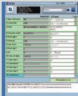
■ Recognition of the machine readable zone (MRZ)