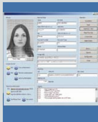
■ Reading the chip information with the RFID chip reader