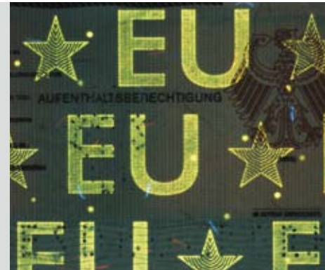
■ Security marks under UV 365 nm