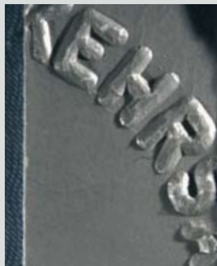
■ Examination of embossed stamps with side light